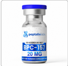
BPC-157 / TB-500 20mg - 128-01-SM