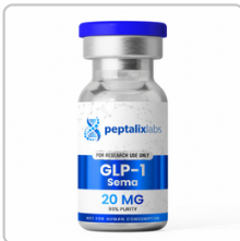
GLP1-Sema 20mg - 125-01-SM