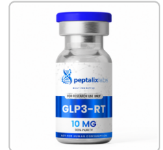
GLP3-RETA 10mg - 126-01-SM