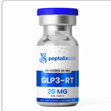
GLP3-RETA 20mg - 124-03-SM