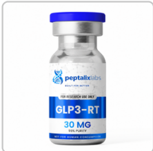
GLP3-RETA 30mg - 129-01-DK